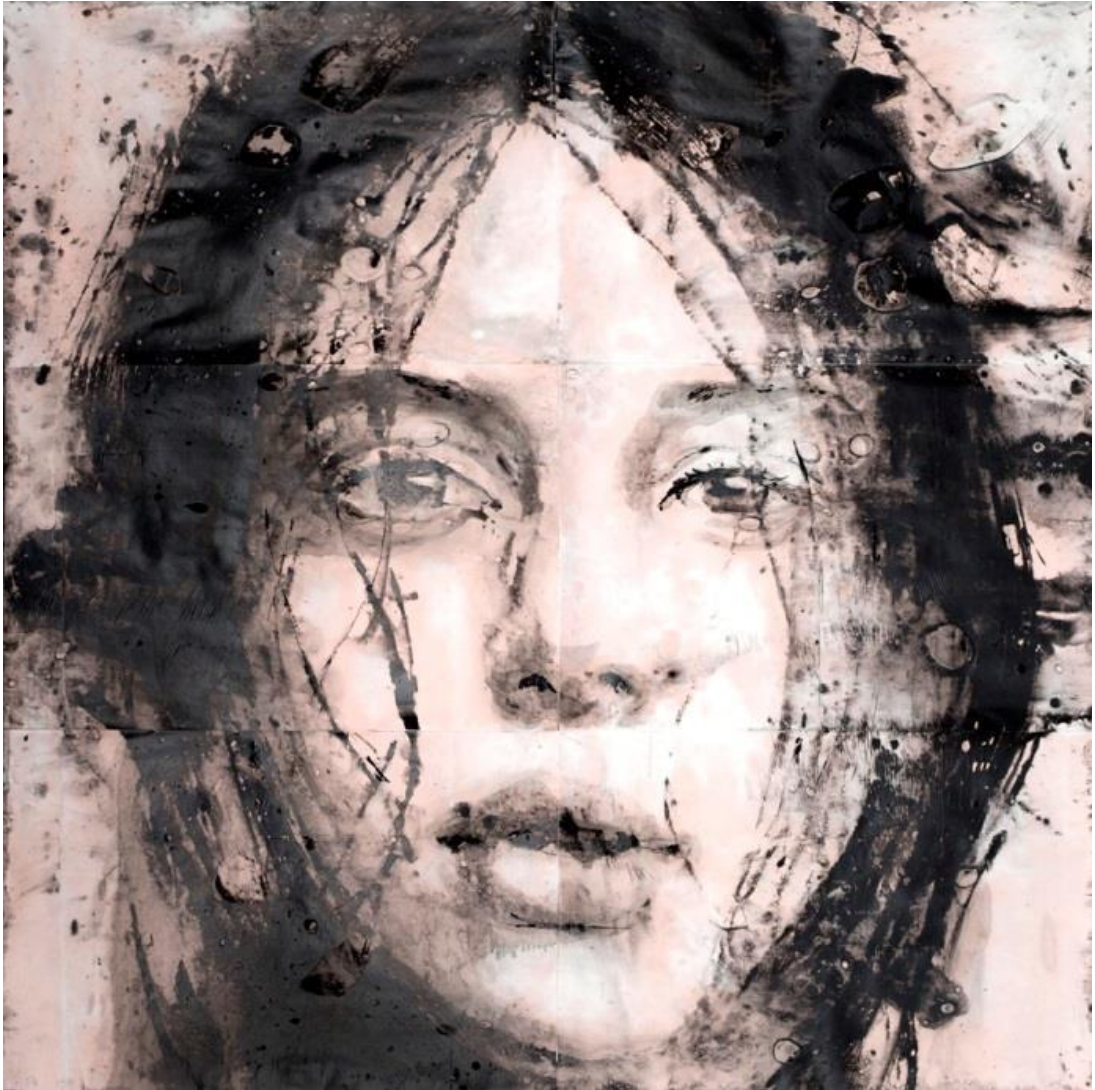
No title – Acrylic and bleach on paper - 180 x 180 cm