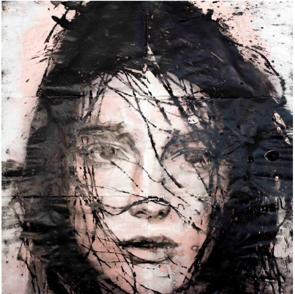
No title – Acrylic and bleach on paper - 180 x 180 cm